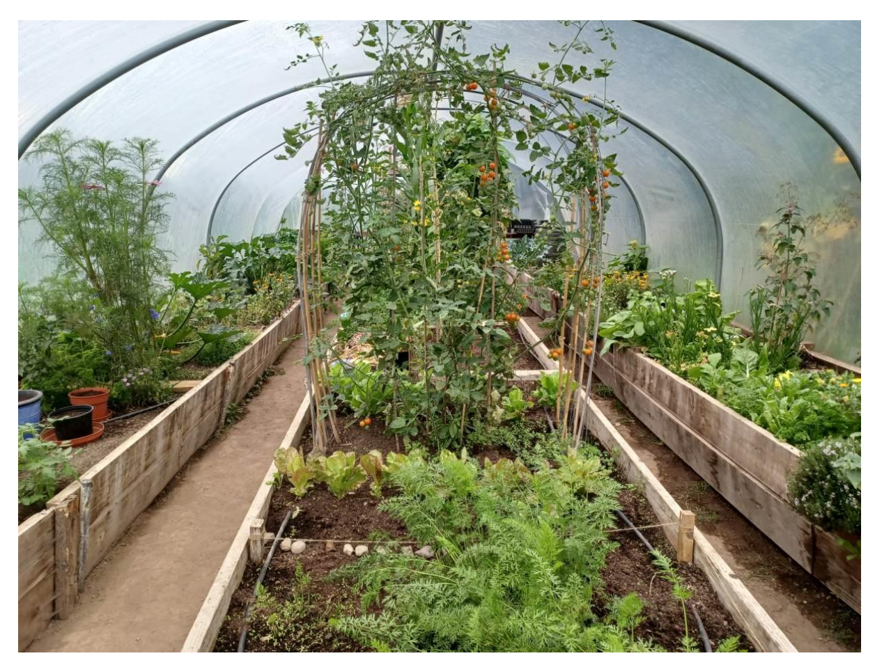
Inside the polytunnel, Denise's section in the foreground, with spaces used by RSS workers towards the rear.