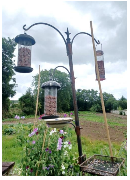
Denise tries to plant one tree every year. Trees give shade when there is heat or rain. She will keep going as long as she can.

Denise would love to see paths in place so that the garden is truly accessible to all, including those of all ages who may have mobility issues. Also, some shelters are needed so people can go under cover if it rains while they are gardening.