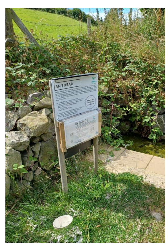
The site of the well from which the centre derives its name.

About five years ago the family decided they wanted to change from the demanding retail sector. They were keen to use facilities which were already on site, as considerable time and money had been invested in them over the years. They became aware of social farming and contacted Rural Support , which oversees social farming in Northern Ireland