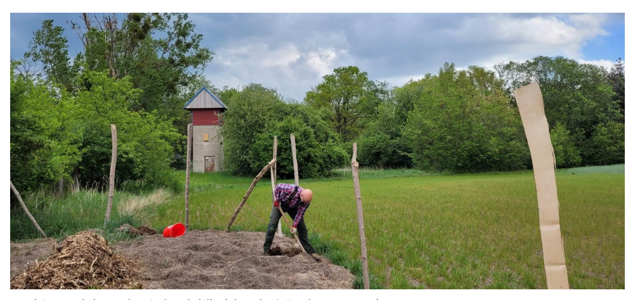
Applying newly learned agricultural skills.

The initiators receive support in the form of advice from various public offices, a start-up consultant and a social bank. Additional ideas come from residents and other people in the municipality.