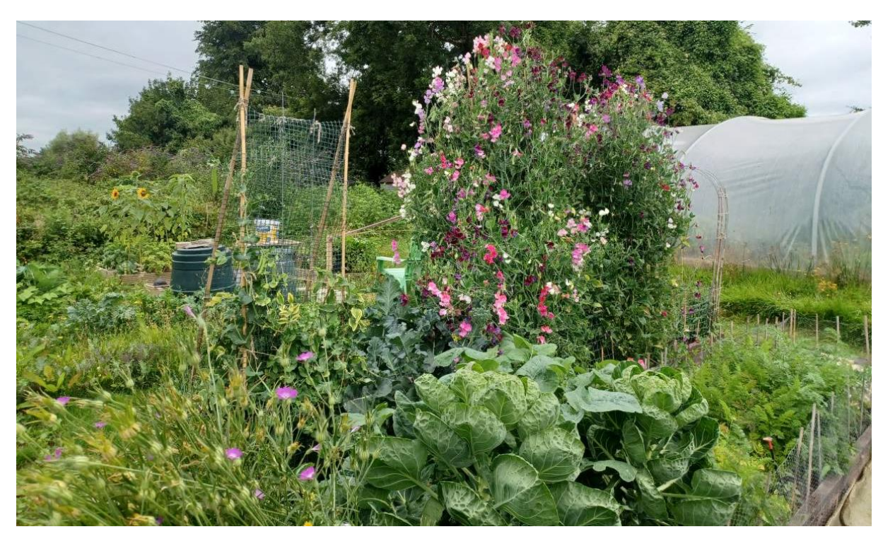
Polytunnel and garden area showing a variety of produce, including the sweet pea flowers.

Denise supplies fruit and vegetables to those residents of Taobh Linn who cook meals for themselves. They tell her what they're planning for meals and she will pick the necessary fruit and vegetables and drop them over to their apartments. She grows lettuce, tomatoes, carrots, parsnips, onions, cucumbers, peppers, and lemons to name a few. She also grows sunflowers, sweet peas and roses. Her trellis of sweet peas is spectacular (see photo) with a lovely aroma.