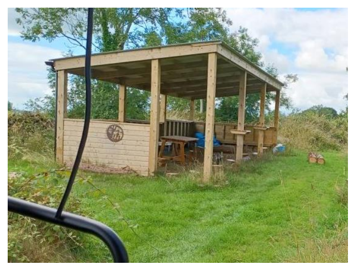
One of the outdoor classrooms at An Tobar.

Also, you have to be sustainable and use and reuse what you have. They have used polytunnels that were in the garden centre as classrooms for teaching horticulture to 2<sup>nd</sup> level students. Also, some tunnels have been repurposed for housing pigs and chickens.