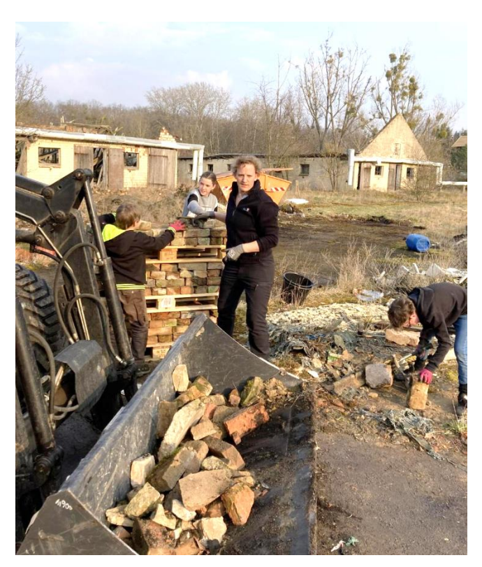
Clearing the site.

The planned newly constructed buildings will later be used for residential communities, nursing homes and an inpatient hospice, according to the needs of elderly people. In addition, a daycare centre for senior citizens is to be implemented under one roof with a kindergarten "Kita Blumenwiese". addition, there will be a doctor's office, administrative buildings, agricultural buildings, commercial halls and a community centre. The latter will offer barrier-free tourism for school classes, families and small groups. After completion of construction work, operations are to start in 2025.