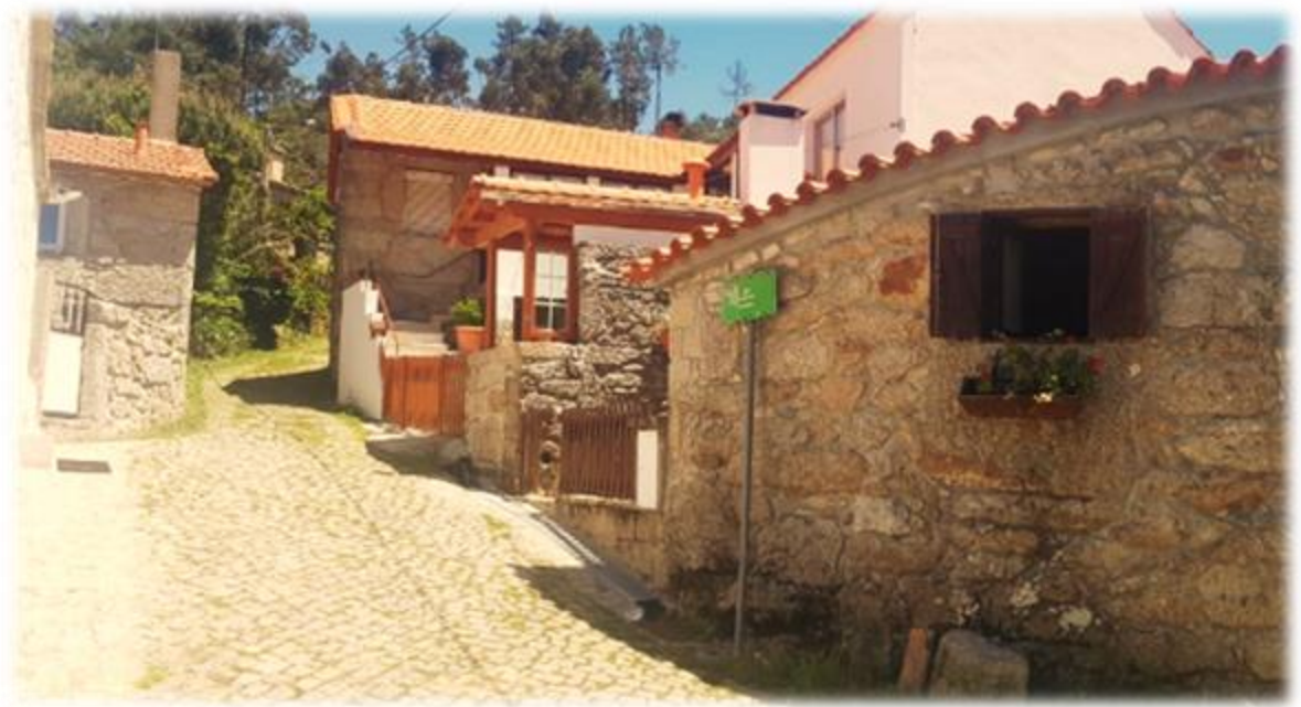
O Associação dos Amigos da Pontemieiro