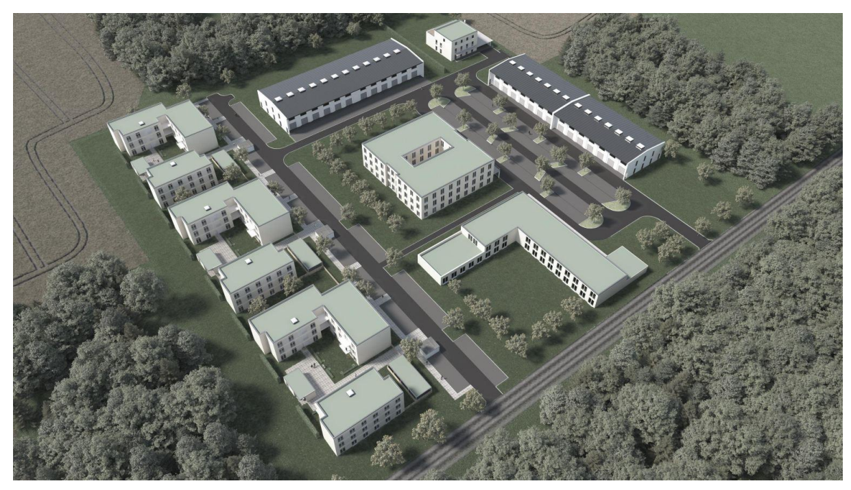
View of the planned site.

The two initiators can well imagine keeping animals on the grounds, such as chickens, sheep and goats. Angela Gabriel is already looking forward to it: "I think it's excellent that the seniors get up in the morning and collect eggs."