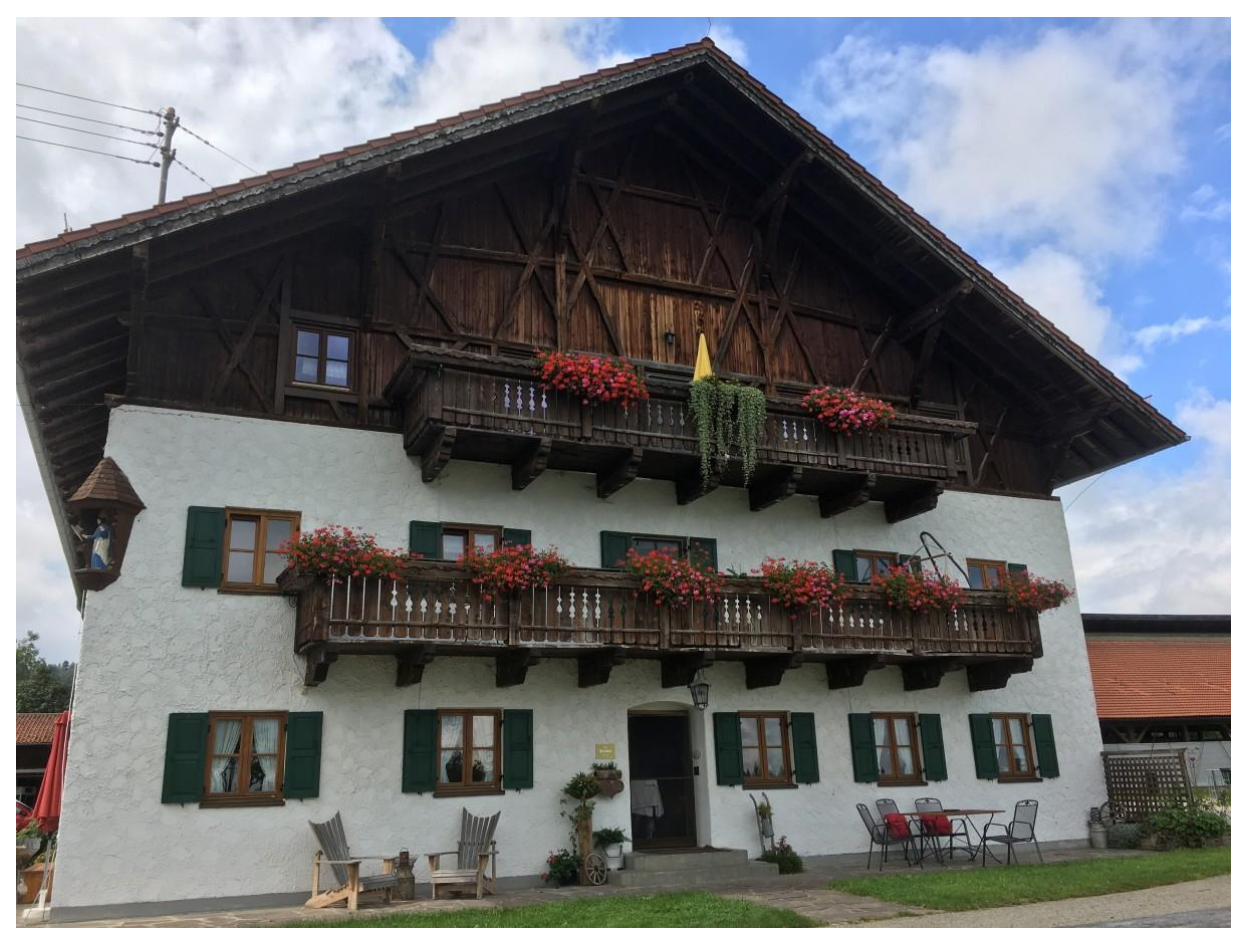
The farmhouse.

The operational situation has not changed much as a result, since the farm continues to be run on a full-time basis and is not financially dependent on the social farming branch of the business. The diversification through social farming enables a "nice additional income" for the agricultural business at Hoimahof.